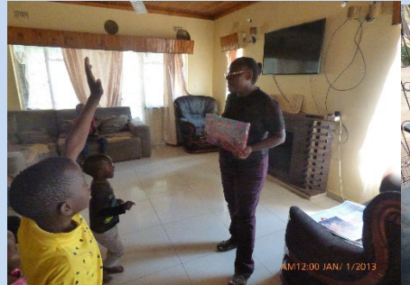
Yes, they play Monopoly