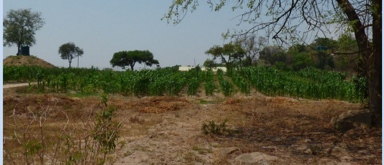
Fields irrigated by Jonathan's Make-A-Wish system Once the entire irrigation system is in place (piping and elevated sprinklers), we will share pictures

Workers wiring Jon's irrigation pump 4-10K liter tanks for irrigation (filled by Jon's pump)