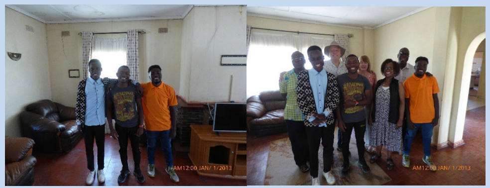
Knowledge, Bright, Innocent