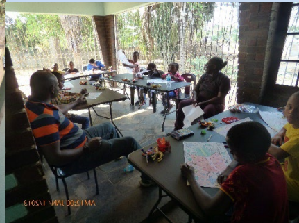
Kids coloring on new classroom tables