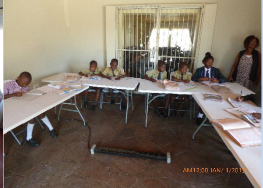
Shammah Home classroom