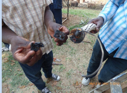
Water geyser burned out thermostat and heating element

From our previous newsletter you may recall that Jonathan's Impact provided funding for a new stove, refrigerator/freezer, and mattresses/box springs for the guest cottage. The guest cottage is not on the borehole system, so relies on city water (not potable, but available for showers, washing dishes, etc.). An ongoing issue has been getting water, especially warm water, for the shower. During a previous visit we had the electric hot water geyser repaired for leaks. However, it has never functioned properly. We now know why: