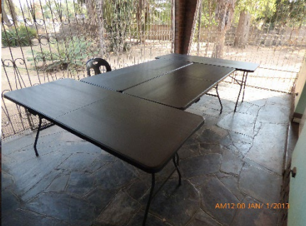
Tables for schoolwork, arts