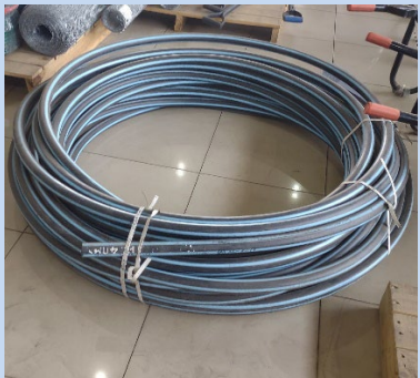
New large garden hosing