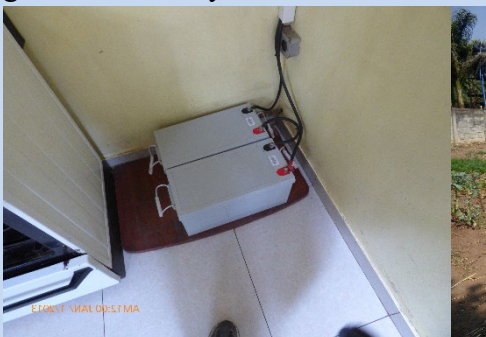
New solar electric system batteries

Additional items purchased for the Chilileko Home during our visit included the replacement of solar electrical batteries for the main home (for backup during electric outages), garden tubing/hosing, several general tools, toys and books for the children, and 4 folding tables for the classroom.