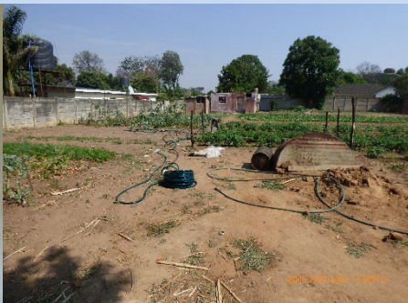
New small garden hosing