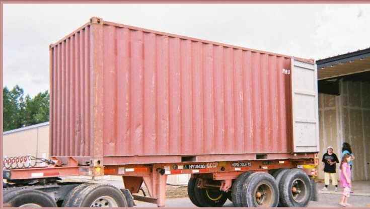
5 20 foot shipping container