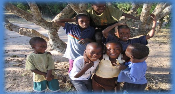
Melfort Boys Clowning Around